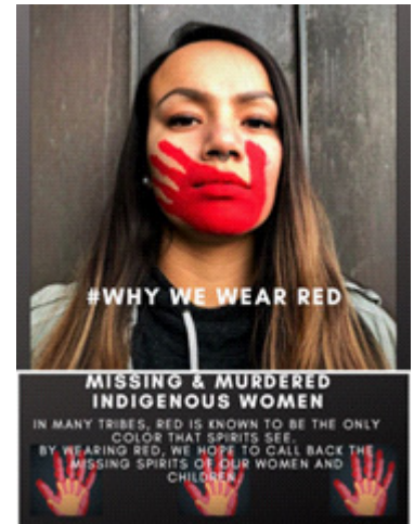
Missing & Murdered Indigenous Women Remembrance Day May 5th