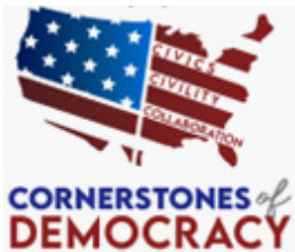
Law Day May 1st