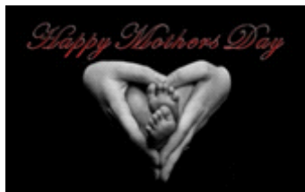
Mother's Day May 14