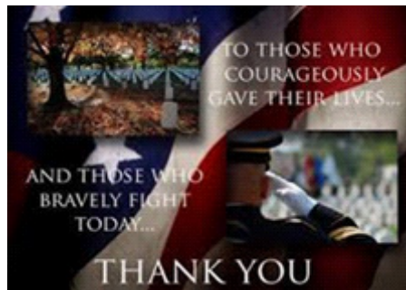
Memorial Day May 29