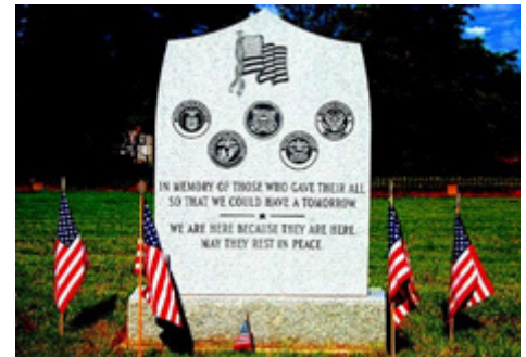
Memorial Day May 31