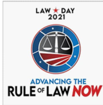
Law Day: May 1