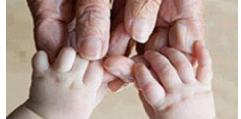
Grandparent's Day September 13