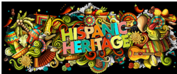
Hispanic Heritage Month September 15 - October 15