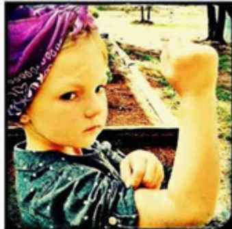
Labor Day September 7