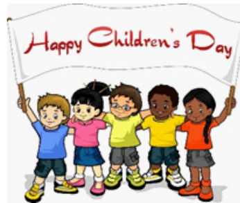
National Children's Day June 9th