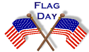
Flag Day June 14th