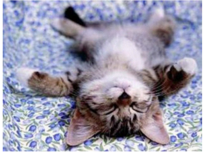
National Relaxation Day: August 15th If you can only celebrate one holiday this year, why not make it this one!