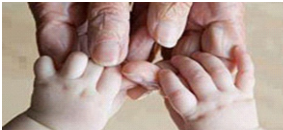
National Senior Citizens Day: August 21st