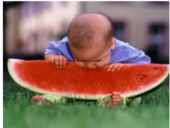
National Watermelon Day: August 3rd