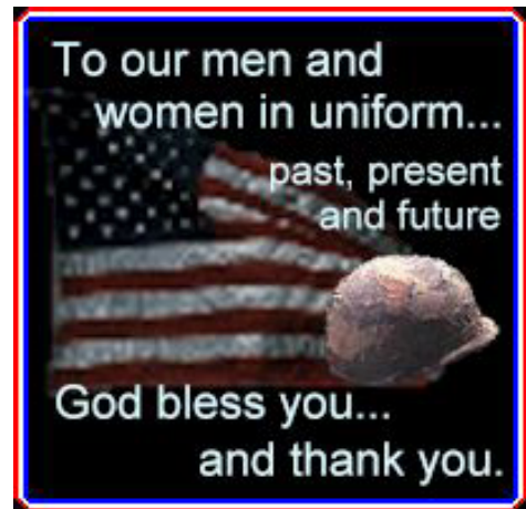
Memorial Day May 25th