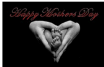
Mother's Day May 10th

Lane County Bar Association c/o Secretary-Treasurer Post Office Box 11379 Eugene, OR 97440