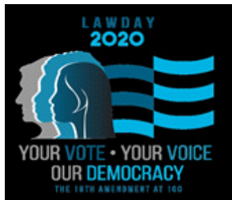
Law Day May 1st