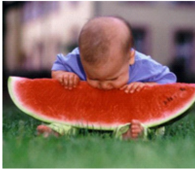
National Watermelon Day August 3