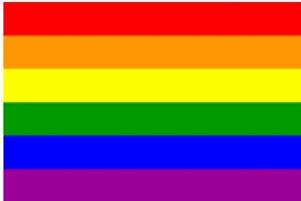
Eugene/Springfield Pride Festival August 14, 2021