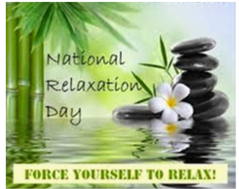
National Relaxation Day August 15