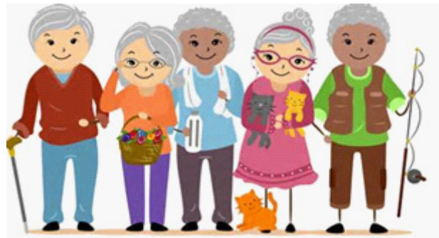
National Senior Citizens Day August 21